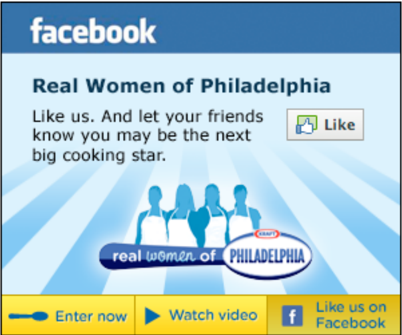
TAB 3: Mousing over this tab will bring up a simple, Facebook branded call to action to Like RWoP. The image should reflect the image used on FB.

Clicking on the video while it's playing will take you to RWoP website.