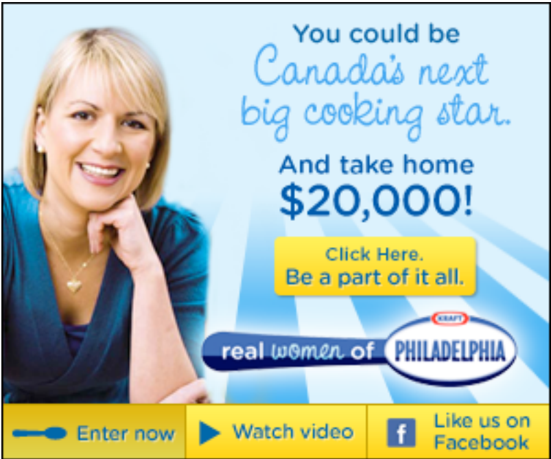
TAB 1: Mouse over tab to reveal RWoP messaging and call to action. Clicking on button or within the frame will take you to RWoP website.