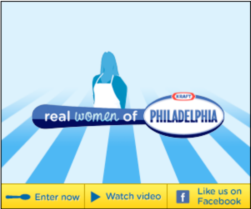
As the logo settles into position, a couple silhouetted woman as slid into position (animation to be done in flash and not the same motion as per video animations)