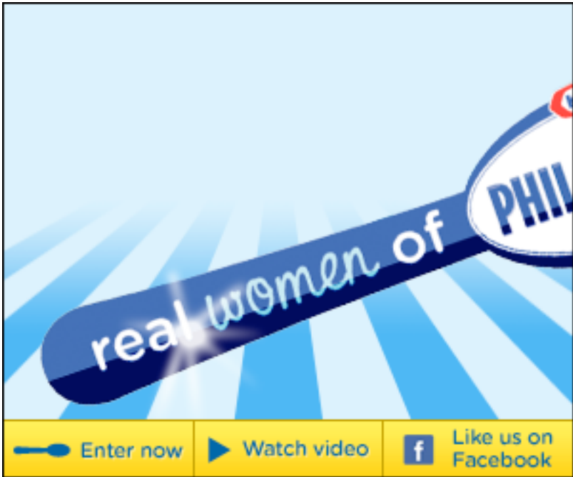
From behind the 'camera' the RVoP logo flies and rotates toward centre screen