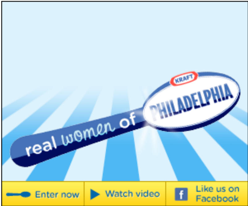
An eye catching lens flare is shimmering across the top of the logo (1st three frame under 1.5 seconds)