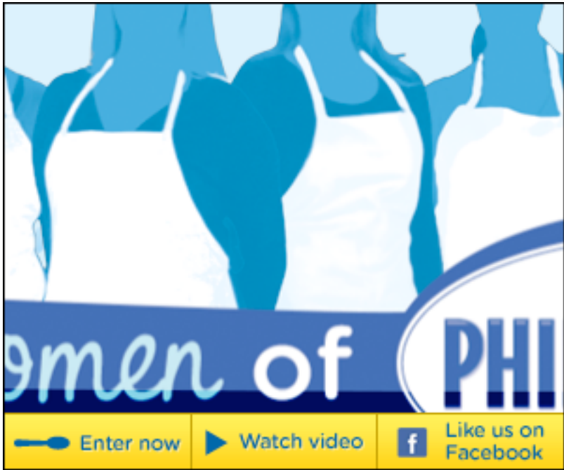
After holding on the logo for a couple seconds the scene zooms into 'camera' (a fraction of a second) and the frame is wiped clean. Then first tab and it's contents are automatically selected