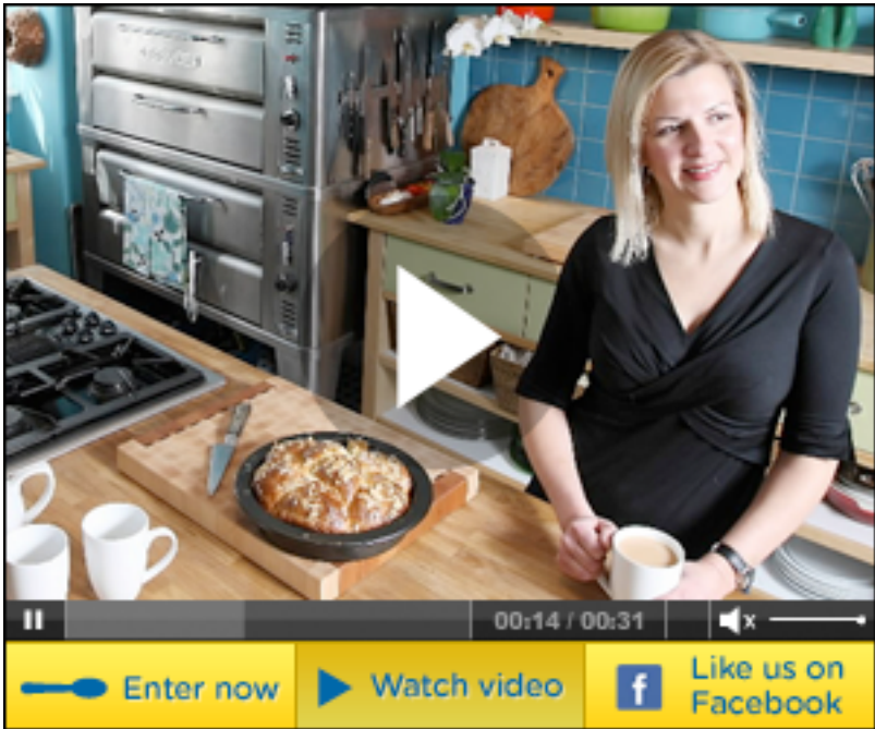
TAB 2: Mousing over this tab reveals a thumbnail image of the video. If the image is clicked on, it is replaced by the video and accompanying playbar / volume control.

Clicking on the video while it's playing will take you to RWoP website.